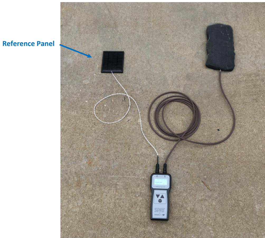
Figure 13: Standard Solar Device Paint Test Connection

When painting a standard WilliamsRDM Solar Device (or other device that connects to the AUX port) the solar device is connected to the AUX port while the reference panel is connected to the TEST port. Figure 13 shows the connection of a standard unpainted WilliamsRDM solar rock and the reference panel. Note that the AUX Port Adapter is not used for this test.