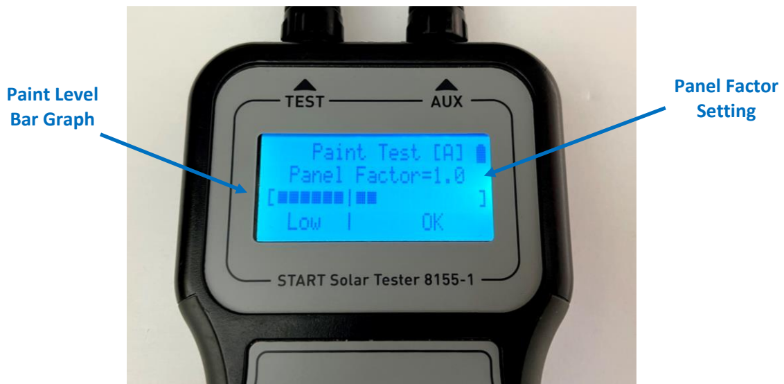
Figure 11: Paint Test Aux Port (Covert Solar Paint Test)

The Panel Factor Setting can be adjusted by the user and is used to allow the tester to support painting of various models and configurations of covert solar devices. The setting is adjusted using the up and down arrows and is stored in memory between power cycles for convenience. The default setting of 1.0 is used for most WilliamsRDM covert solar devices but, some models require a change to this setting. For example, the 8203-1 requires a panel factor setting of 2.0. The power factor is essentially a scaling factor to allow painting of various solar devices with different solar panel configurations. For convenience, the Panel Factor can be obtained from the WilliamsRDM website for a particular solar panel model.