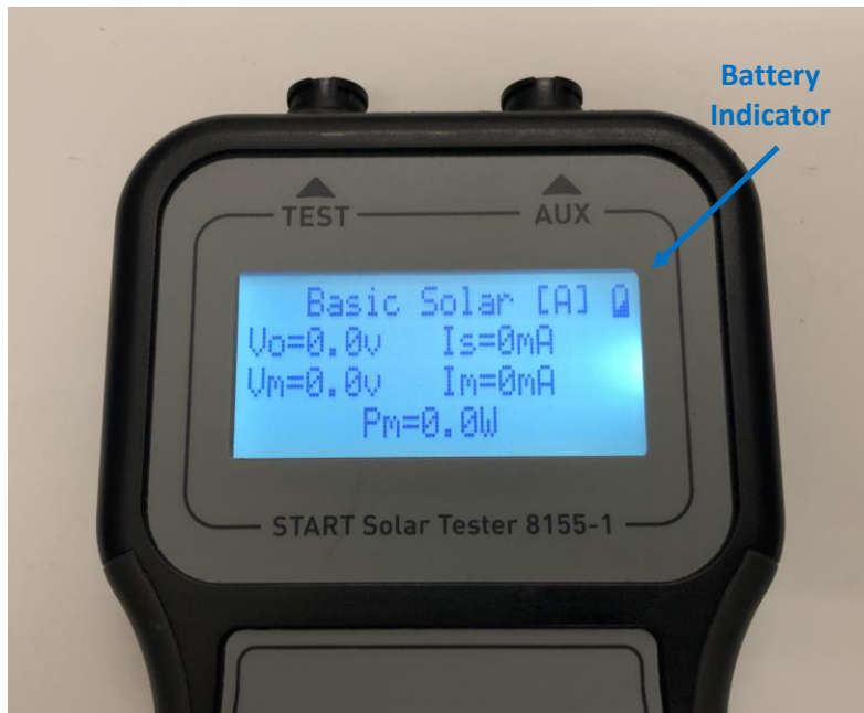
Figure 5: Battery Indicator

The Battery indicator is shown in the upper right corner of the display on any test screen (see Figure 5). The battery indicator provides a visual indication of the remaining battery capacity so that the user can replace the batteries before they are exhausted. The batteries should provide several hours of operation. Additionally, If the tester is left on it will automatically power off after 15 minutes of inactivity to conserve power.