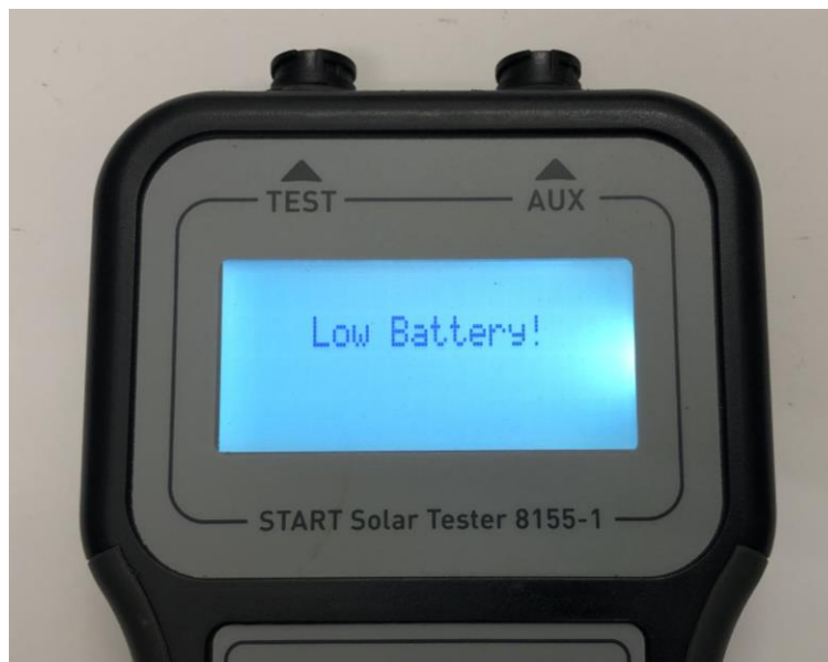
Figure 6: Low Battery Screen

When the batteries are exhausted the low battery screen will be displayed as shown in Figure 6 and the solar tester will automatically power off. At this time the batteries must be replaced to use the tester again.