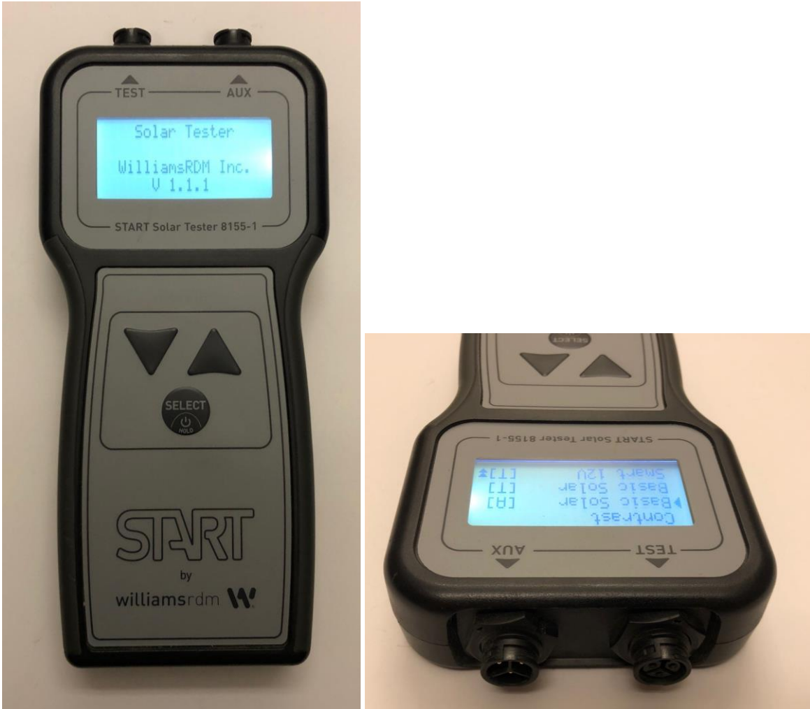
Figure 2: Solar Tester

The Solar Tester is shown in Figure 2. The tester has three buttons for the user interface and a backlit LCD for easy readability in all lighting conditions. The device has two connectors for testing various solar products, the “TEST” port and the “AUX” port. The “TEST” port is typically used to test WilliamsRDM Smart solar devices while the “AUX” port is typically used to test WilliamsRDM and equivalent standard solar devices and solar panels. The unit is powered on by pressing the “SELECT” button and powered off by pressing and holding the “SELECT” button for about 2 seconds. The Up/Down arrows are used to navigate the menu system and the “SELECT” button is used to select a test as well as to exit from a test back to the main menu.