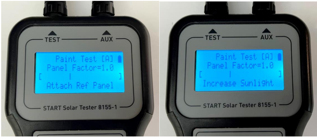
Figure 12: Paint Test Messages