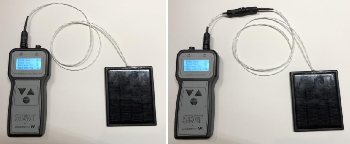
Figure 16: Reference Panel Test (TEST Port Left, AUX Port Right)

There are two Reference Panel Tests. The Reference Panel [T] (TEST Port) Test is used to test the reference panel when connected to the TEST port. The Reference Panel [A] (AUX Port) Test is used to test the reference panel and AUX Port Adapter when connected to the AUX port. This test is primarily used to test the functionality of the Reference Panel and AUX Port Adapter to ensure they aren’t damaged. Figure 16 shows how the reference panel and AUX port adapter are connected for the two reference panel tests.