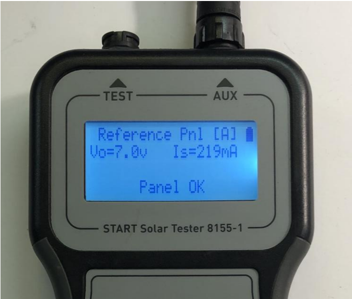
Figure 15: Reference Panel Test Screen

of the solar panel as well as an indication that the reference panel is OK. If there is not enough sunlight for the test the “Increase Sunlight” message is displayed.