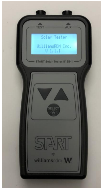
Figure 1: WilliamsRDM 8155-1 Solar Tester

The WilliamsRDM Solar Tester (Figure 1) is built to test the voltage, current and power output of the WilliamsRDM covert solar devices and other equivalent solar systems. The tester can be used to verify proper operation and wiring of repaired cables and solar panels. It can also be used to measure the performance of the solar panels in a deployed location to verify operation and power output. Using the optional paint adapter kit, the solar tester can be used as a guide to apply WilliamsRDM's custom formulated paint to the covert solar devices in the field without the fear of over painting and thus degrading the solar devices.