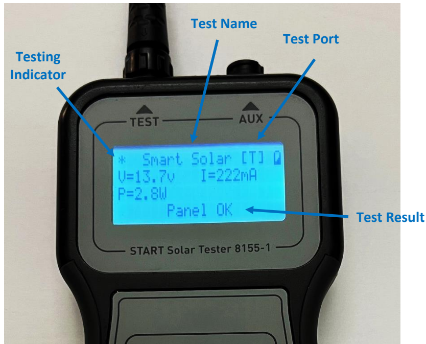
Figure 9: Smart 12V Solar Test Screen