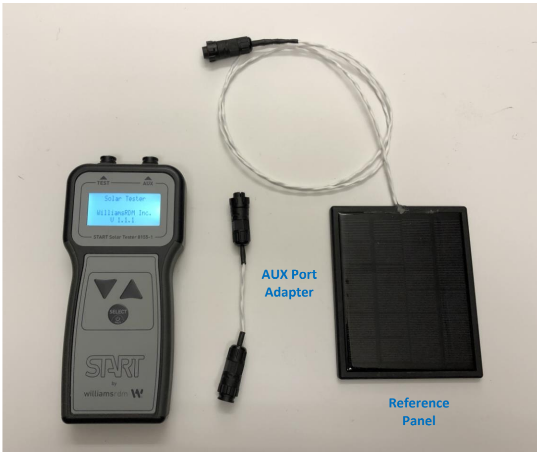
Figure 10: Optional 8156-1 Solar Paint Adapter Kit