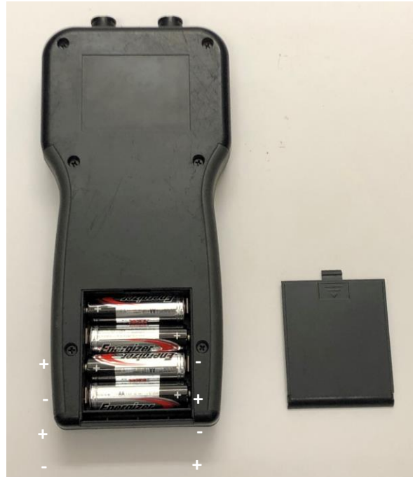
Figure 7: Battery Installation

The solar tester is powered from 4 standard AA alkaline batteries which can be easily replaced by the user. Always use new AA alkaline batteries of the same brand in the solar tester. When replacing batteries don't mix and match batteries of different brands or new and old batteries. To replace the batteries, remove the battery cover from the back of the solar tester and replace the batteries. Figure 7 shows the orientation of the batteries within in the battery holder. If the solar tester is going to be stored for several months the batteries should be removed to prevent corrosion.