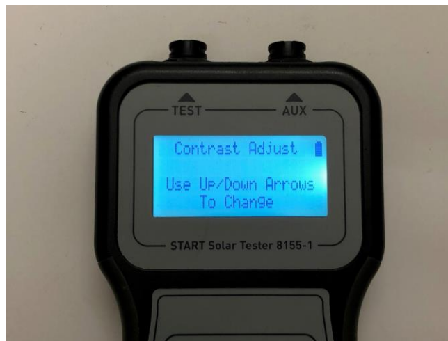
Figure 4: Contrast Adjustment Screen

If the Solar Tester Display is too light or dark the contrast can be adjusted by selecting the “Contrast” option on the menu screen. Once the Contrast option is selected the contrast adjustment screen is displayed as shown in Figure 4. The screen contrast can then be adjusted using the up and down arrows. Once the desired display contrast is reached press the “SELECT” button to exit back to the main menu. The contrast setting will be saved once it is set.