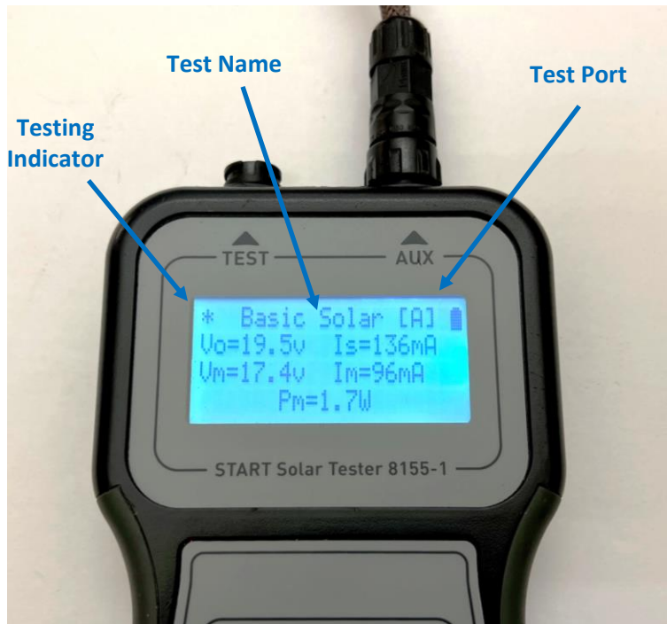
Figure 8: Basic Solar Test Screen

Figure 8 shows an example test screen for the basic solar test on the “AUX” port which is used for the WilliamsRDM standard solar devices. The solar tester reports several solar panel test parameters to ensure the solar panel is working properly. Table 1 shows an example of the test parameters provided by the solar tester for the basic solar test as well as their definitions and a brief description of their meaning. Additionally, the Testing Indicator turns on whenever the solar panel is actively being tested. To support testing of solar panels with higher power levels the solar panel sampling rate slows down as power increases to minimize power dissipation in the solar tester. For example, when measuring a 10W solar panel the test will be performed about once every 10s and with a 1W panel the measurement rate is about 1s. The testing indicator is used to inform the user when the test is performed.